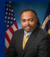
A. Clayton Rotation to MSFC